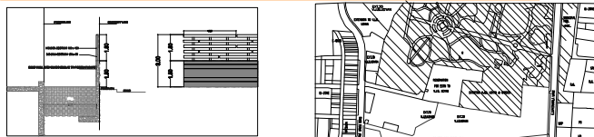
COMPOUND WALL SECTION (AT ROAD SIDE) SCALE :- 1:100

R.C.C. COMPOUND WALL TO ACT AS HOSE BARREL