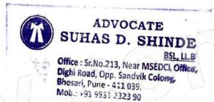
Suhas d.Shinde Advocate